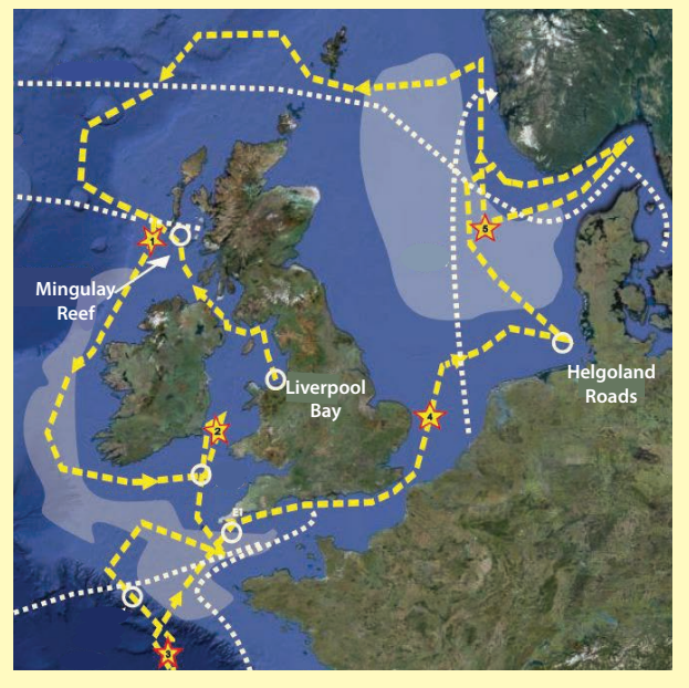
Stars = sites where bioassay experiments* were undertaken. White dashed lines = tracks along which the Continuous Plankton Recorder is deployed, mostly using regular ferry routes. Circles = sites of existing time-series. Grey areas = sites of frequent coccolithophore blooms (another area addressed during the cruise).

Each day before the sun rose, sleepy scientists made their way on deck to greet the CTD (a conductivity-temperature-depth meter) attached to a large water sampler. This instrument collected water from a variety of depths at 70 sites around the UK, from up near the Shetlands down to the Bay of Biscay. Once back on the ship, the biology and chemistry of this seawater was examined to investigate everything from the concentrations of different dissolved gases, to the carbonate chemistry, nutrient concentrations and microscopic life. Results so far have found large variability in the carbonate chemistry of surface waters around the UK, with a pH range of around 0.3 units, which also happens to be the projected future 100-year decrease in mean pH.