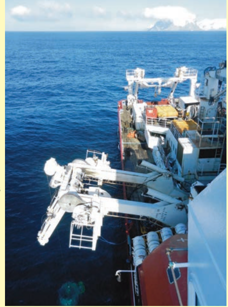
Beginning a CTD cast near the South Shetland Islands

Alongside these bioassays, we carried out morning and evening CTD rosette casts down to 300 m on most days, collected underway samples at a maximum of 2-hour intervals throughout the cruise, and a few full-depth CTD rosette casts, all again for a wide range of biological and biogeochemical measurements. These will allow us to characterise the surface ocean using multivariate statistical analyses and, importantly, they will provide context for the bioassay results.